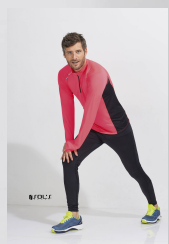
BERLIN MEN 01416