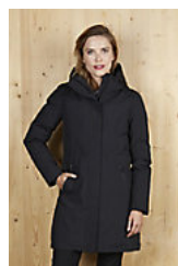
NEOBLU ALFI WOMEN 04005