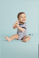
MILES BABY 01401