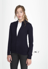
GORDON WOMEN 00550