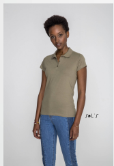
PRESCOTT WOMEN 11376