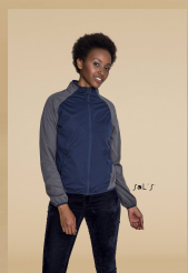
ROLLINGS WOMEN 01625