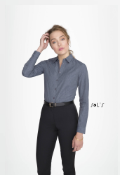
BARNET WOMEN 01429