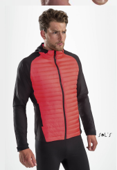
NEW YORK MEN 01471