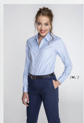
BRODY WOMEN 02103