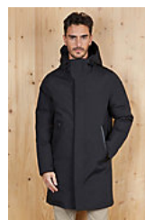
NEOBLU ALFI MEN 04002