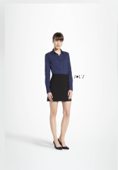
BECKER WOMEN 01649