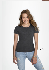
REGENT FIT WOMEN 02758