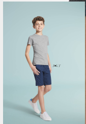
REGENT FIT KIDS 01183