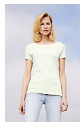
SOL'S MARTIN WOMEN 02856