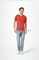
MURPHY MEN 01836