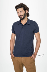
PHOENIX MEN 01708