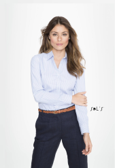
BEVERLY WOMEN 01651